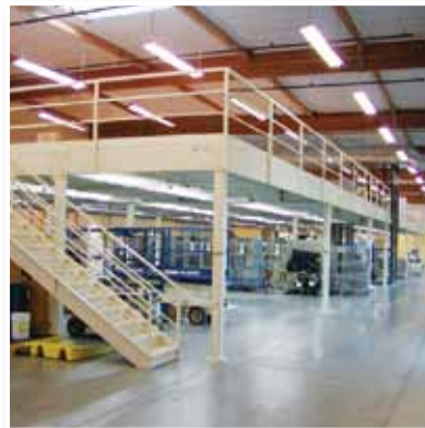
Our high-quality mezzanine materials create a safer, more productive work environment.

Let us create an AISC certified structural mezzanine that fits the way you work. Trust Cubic Designs for the perfect fit.