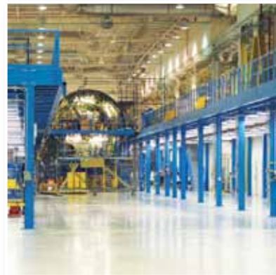
Mezzanines can be customized to accommodate very unique facility requirements.