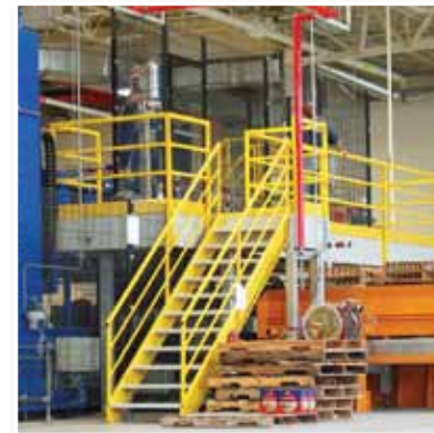
We tailor each mezzanine design to fit within a particular building footprint.

Distribution ■ Manufacturing ■ Automotive ■ Inventory Storage ■ Beverage Industry ■ Product Storage ■ Office Space ■ Maintenance