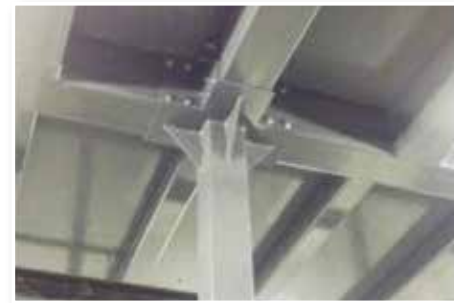
Enclosed square/rectangle tube steel