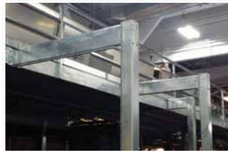
Fastener connection design minimizes exposed threads