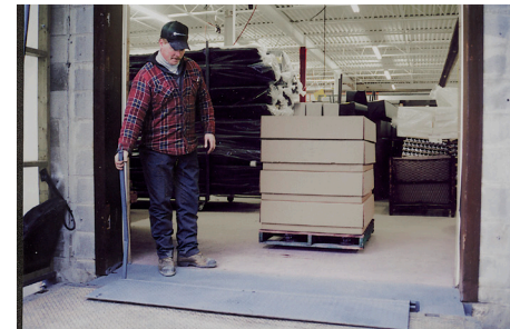
Safety is enhanced through less operational effort. Increased convenience and safer than aluminum dock plates.